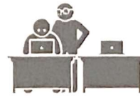
Solving Problem Together