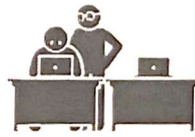
Solving Problem Together