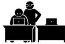
Solving Problem Together