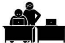
Solving Problem Together