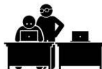
Solving Problem Together